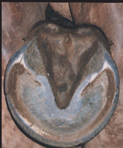
Clean dirt line

Blend trimmed area outward to within approximately 1/2 inch (13 mm) of the white line at the toe and to the approximate white line at the quarters. Remove any runaway/excess bar that is forward of the midpoint of the frog. The sole should be passive to the wall (i.e., the primary ground contact should be with the outer wall; the sole makes secondary contact with the ground as the weight descends).