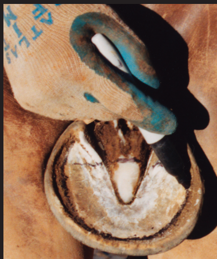
Inner sole line

Using a felt tip pen draw a reference line around the edge of the sole. This is where the sole meets the wall or, if separation is present, where the sole meets the separation.