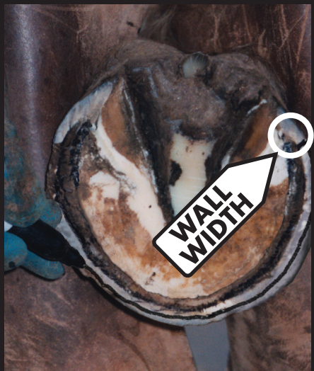
Outer sole line

Using the width of the wall measured at the heel, draw a second line outside of the first line shown in the figure of Step 9.