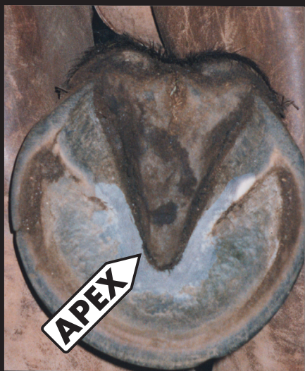
Clean dirt line